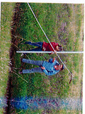
Measuring a stream cross-section

Stipend: $37/day received as a lump sum at end of program.