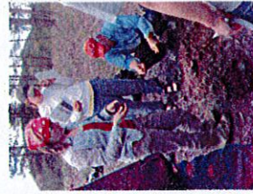
Exploring soil science

"YFMP is amazing...it truly exposes students to what science is all about."